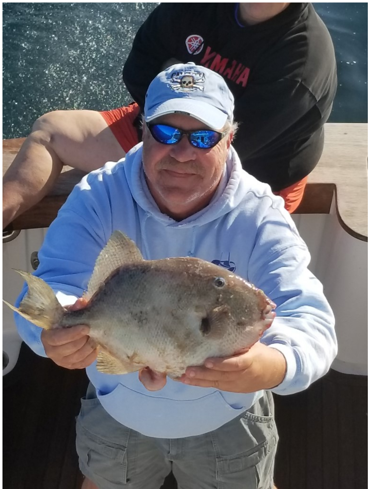
Figure 1. Angler with catch while aboard the Underdog.